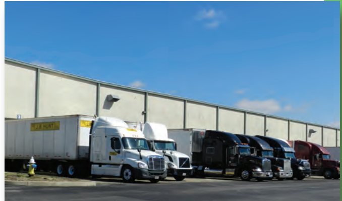
Remar helps you reduce shipping costs, lower capital investment and risk, and reduce staff and overhead costs.

We're also strategically located within a two-day shipping radius of 80% of the entire U.S. population, and our facility is less than one mile from I-40, less than five miles from SR-840, and less than 15 minutes from USPS's processing facilities at the Nashville International Airport, allowing for fast and efficient connection to all distribution networks.